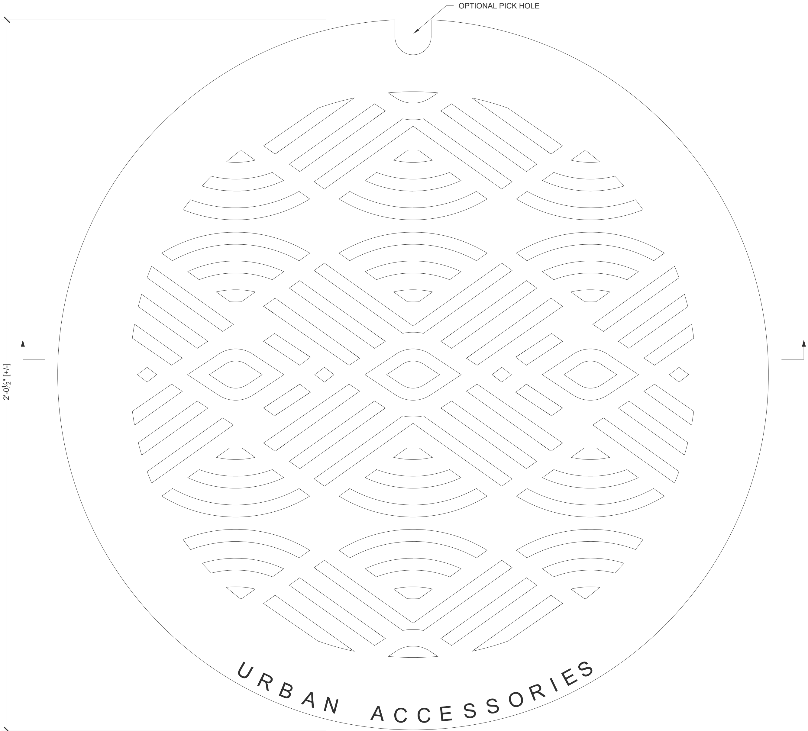
Plan Scale: 6" = 1' 0"