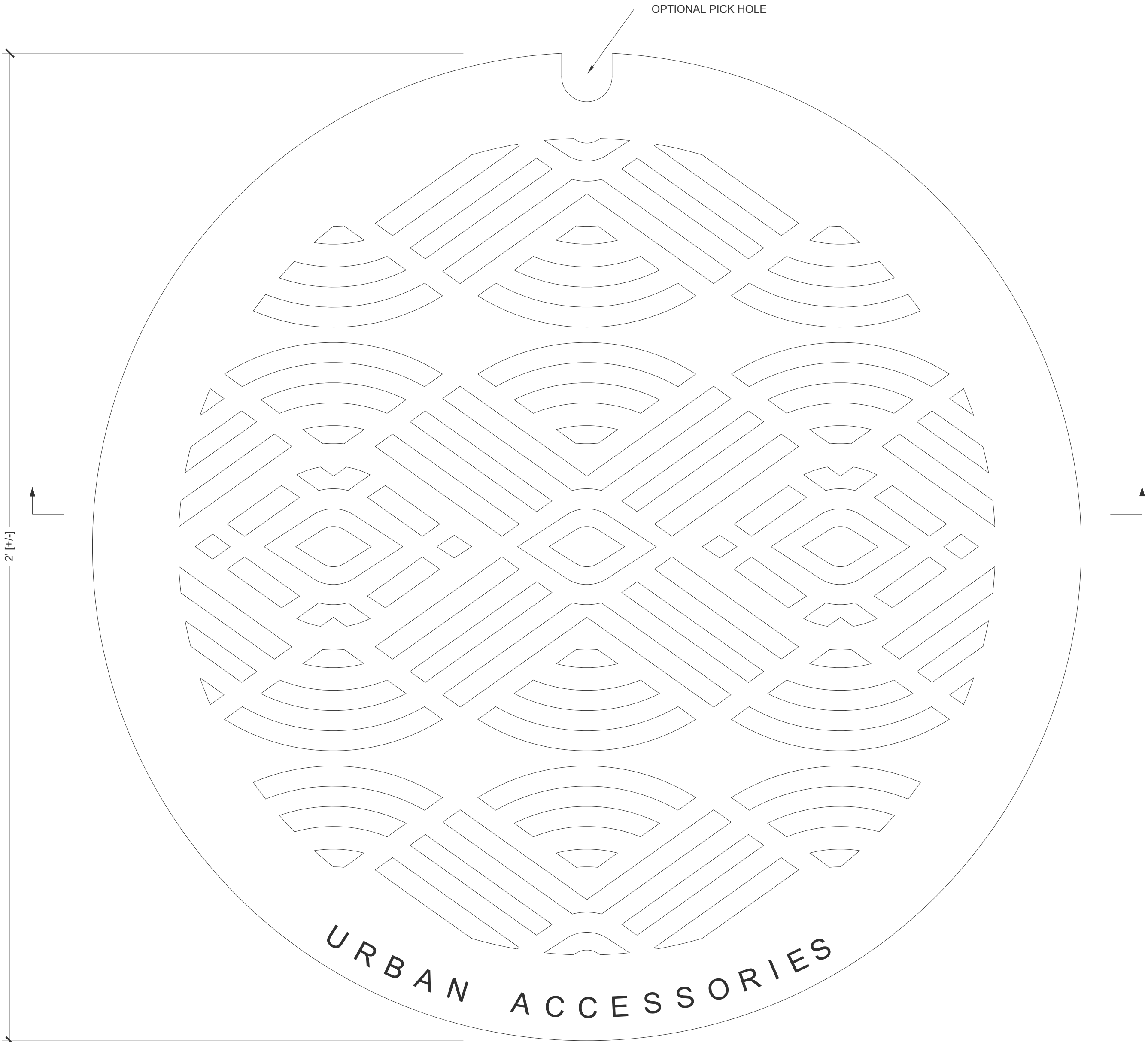
Plan Scale: 6" = 1' 0"