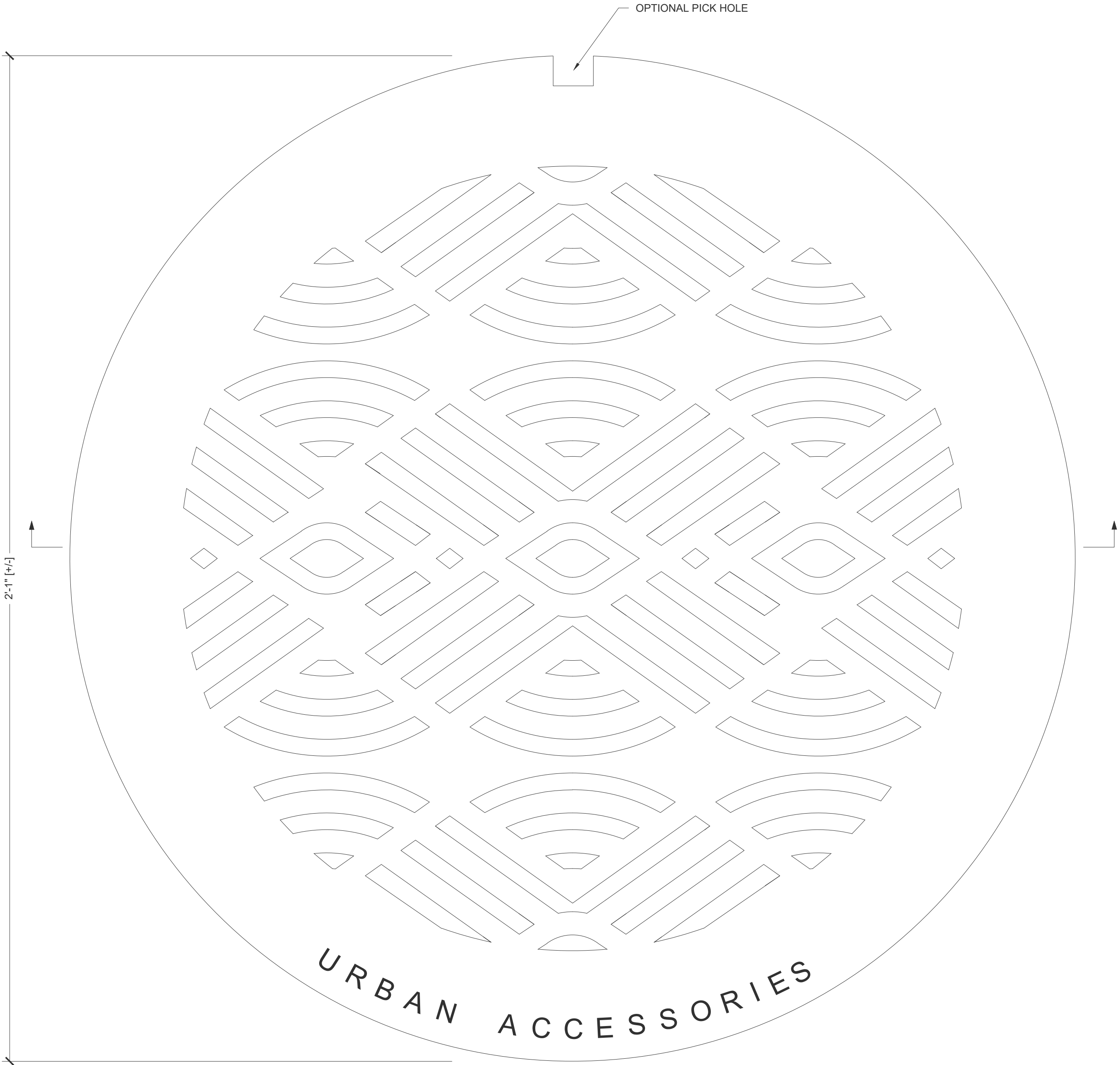
Plan Scale: 6" = 1' 0"