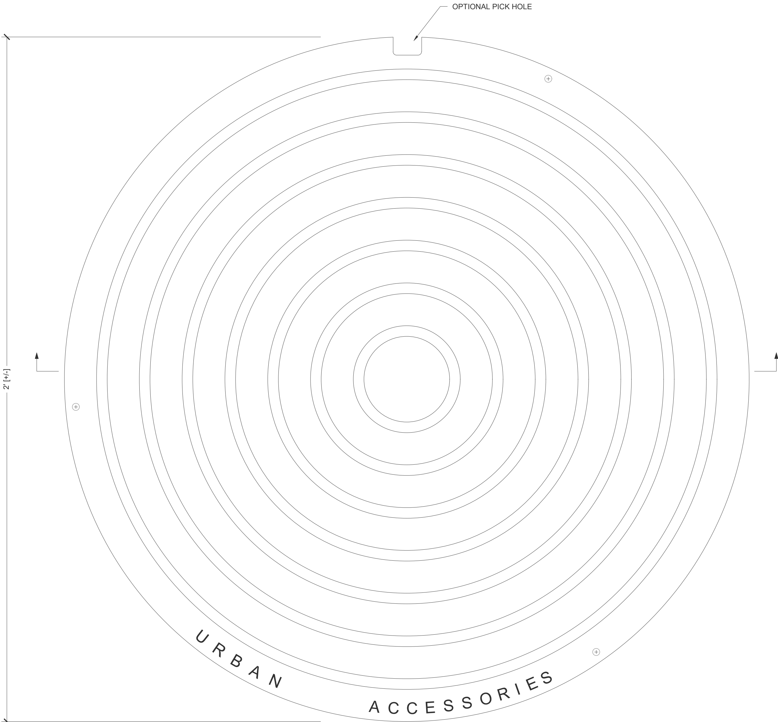
Plan Scale: 6" = 1' 0"