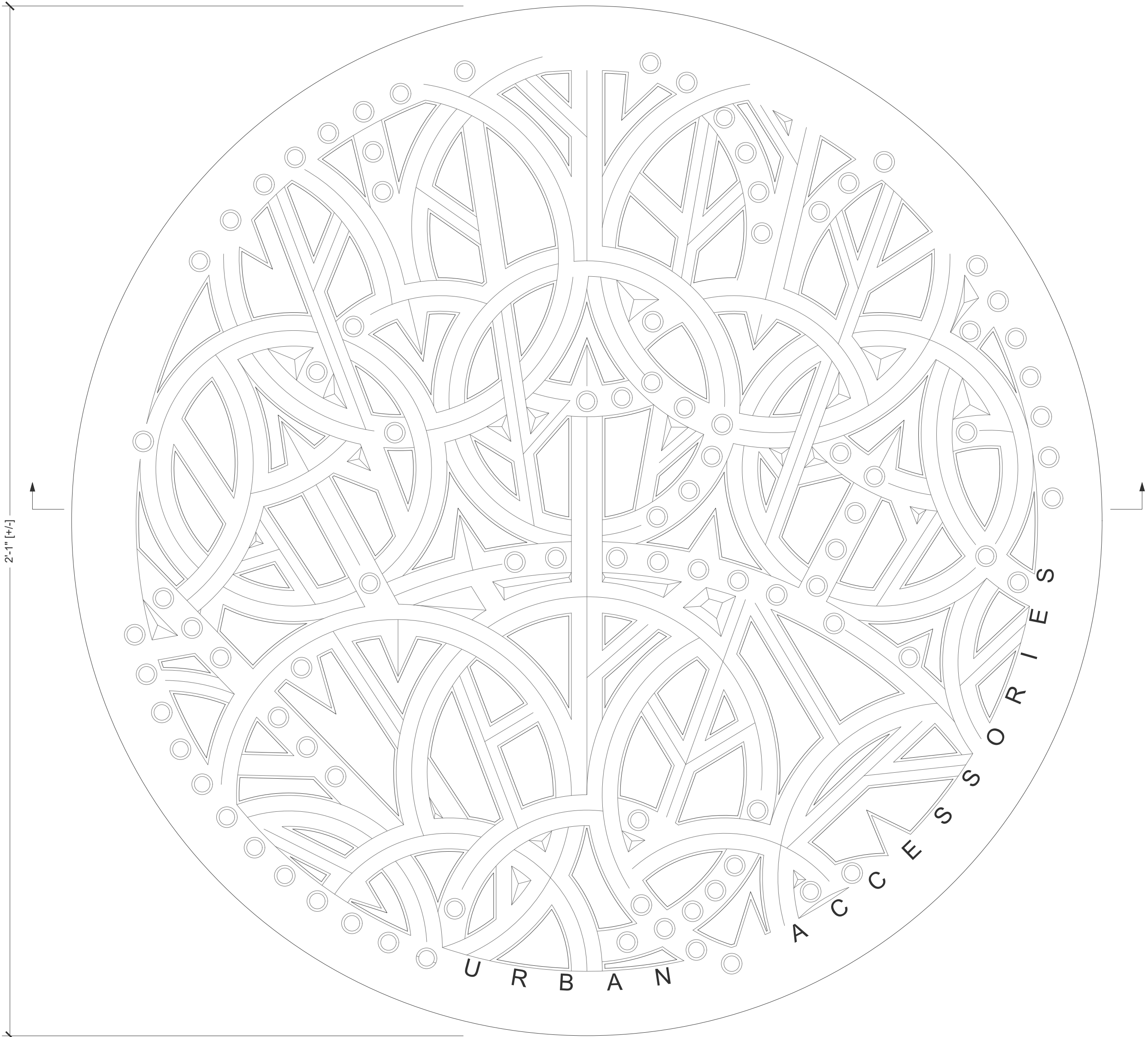
Plan Scale: 6" = 1' 0"