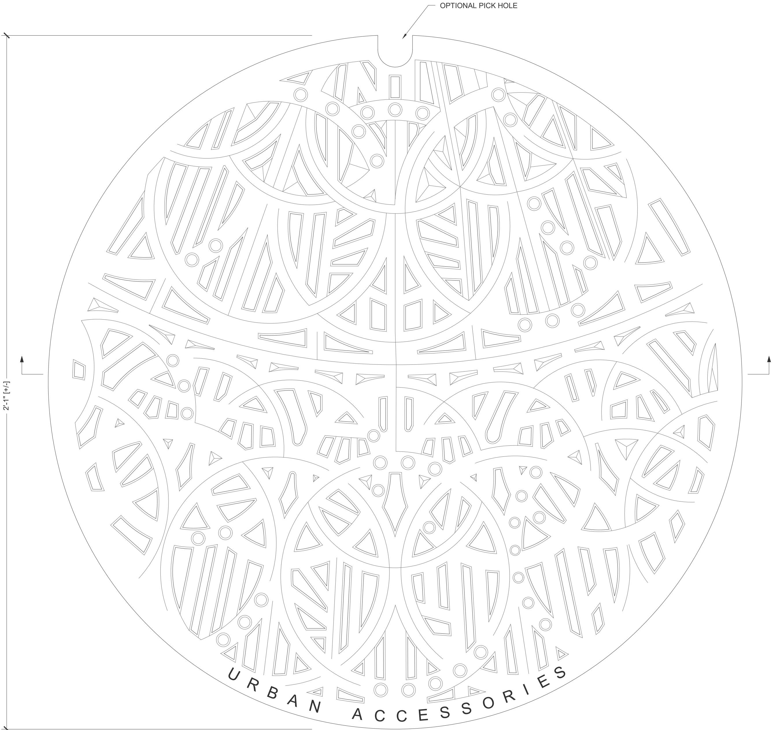
Plan Scale: 6" = 1' 0"