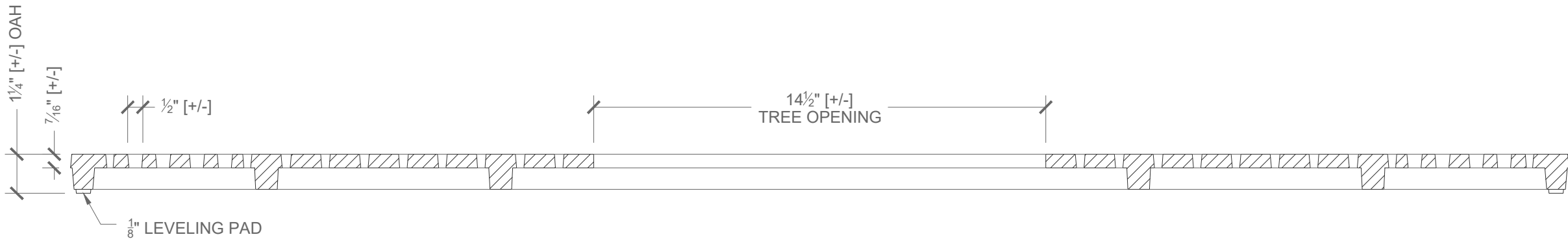
Longitudinal Section Scale: 3" = 1' 0"