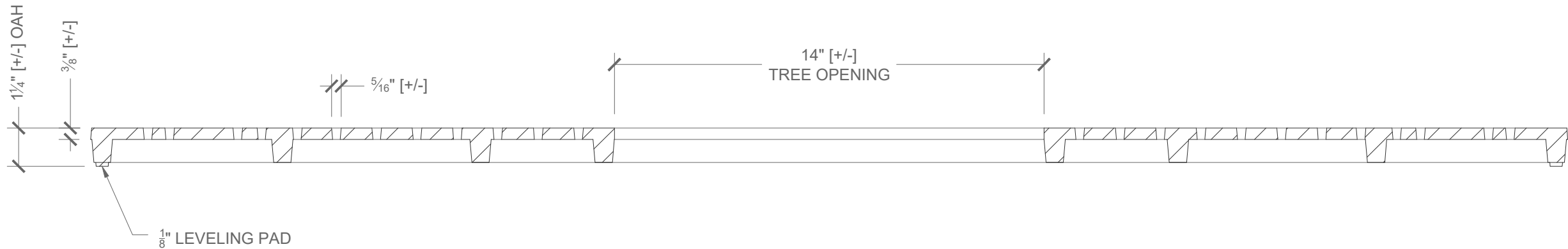
Cross Section Scale: 3" = 1' 0"