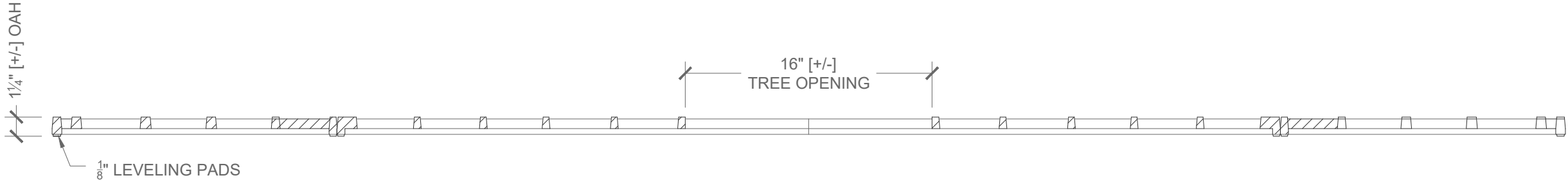
Cross Section Scale: 1 1/2" = 1' 0"