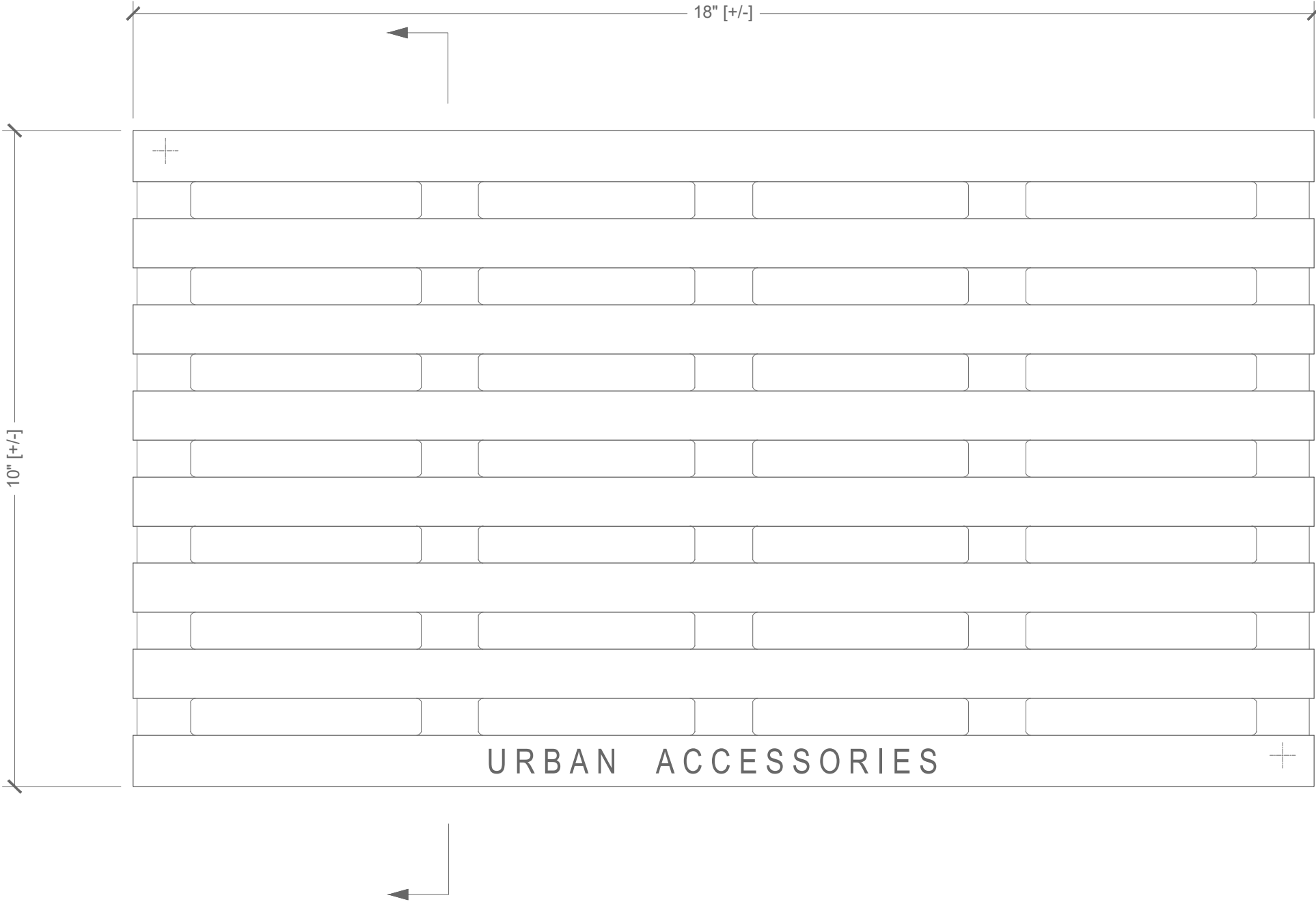
Plan Scale: 6" = 1' 0"