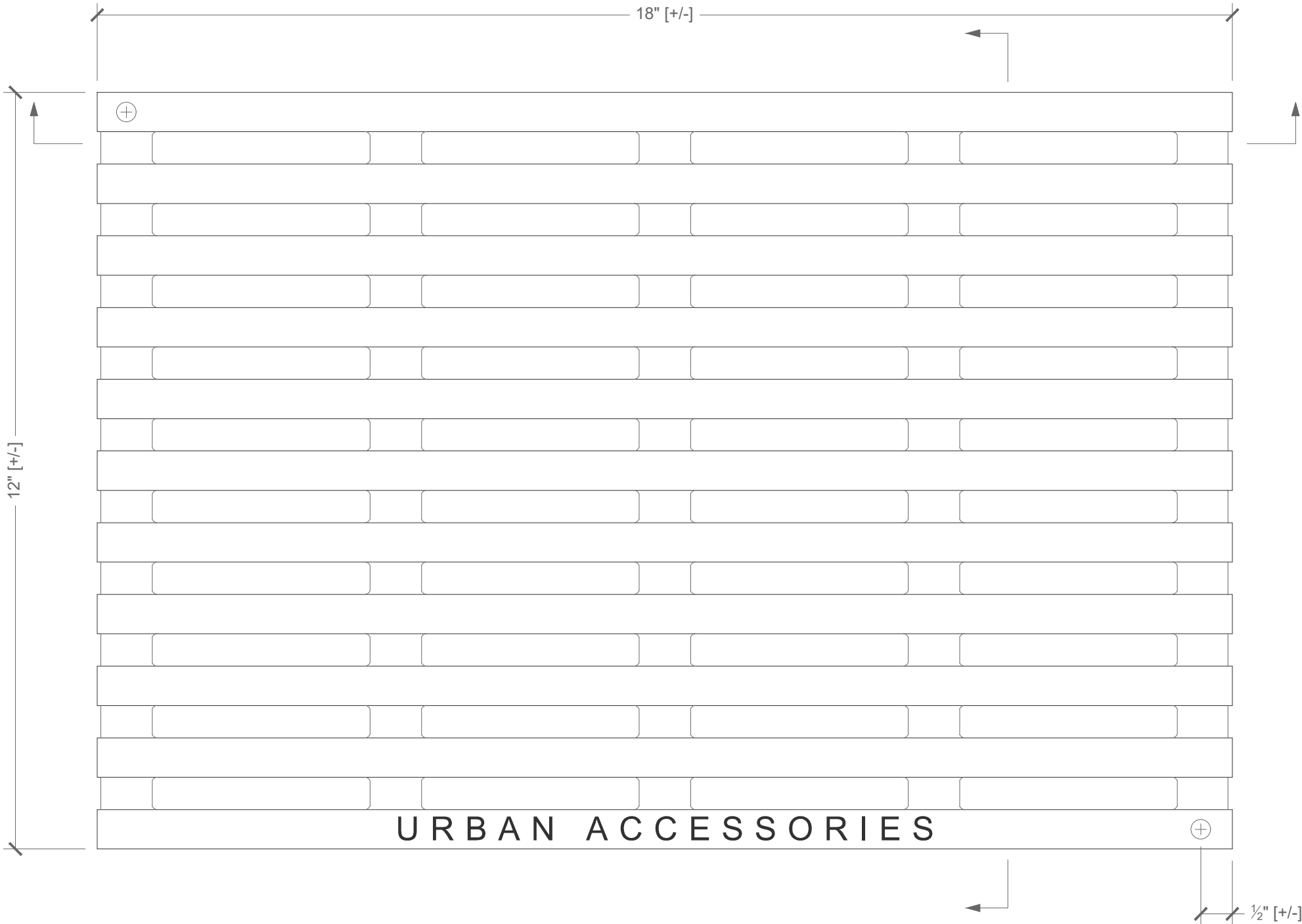
Plan Scale: 6" = 1' 0"