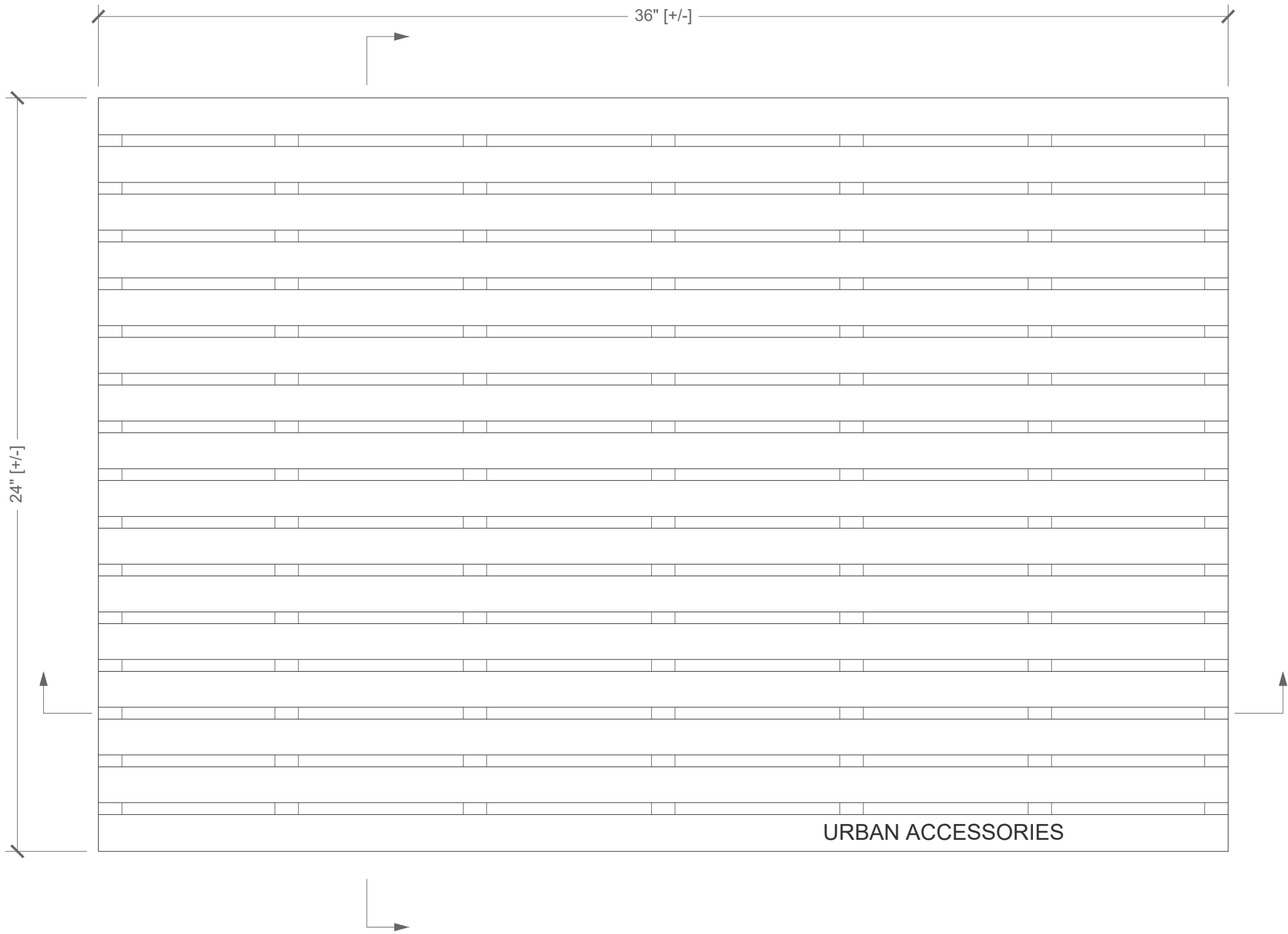
Plan Scale: 3" = 1' 0"