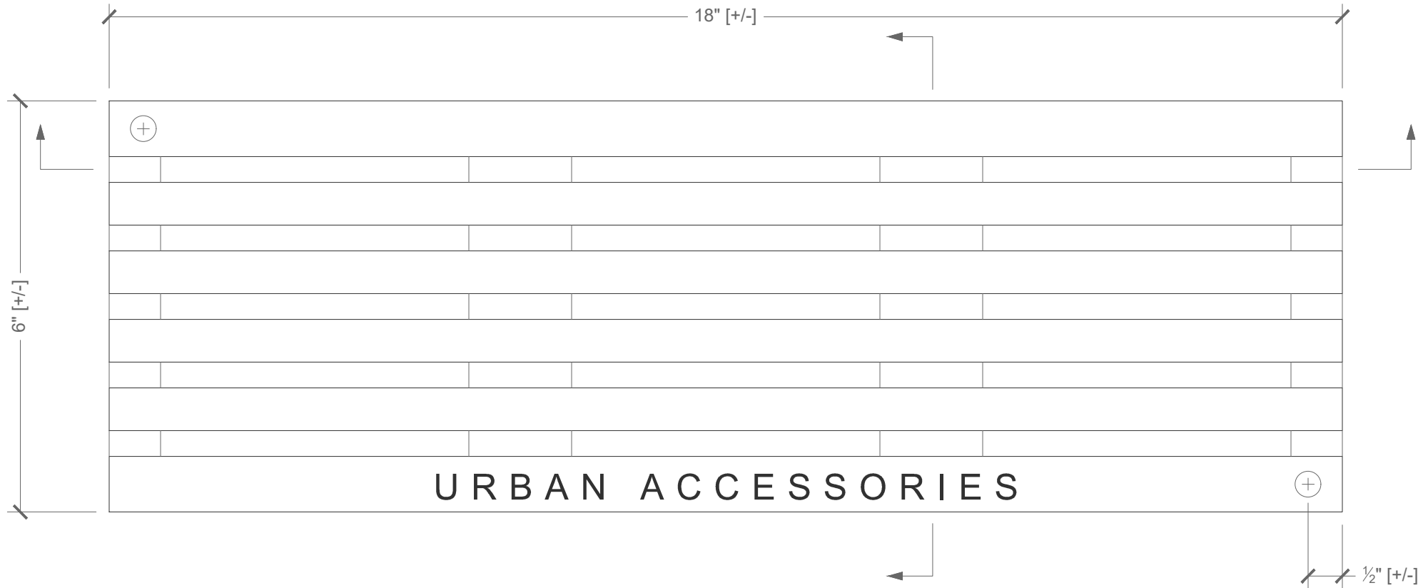
Plan Scale: 6" = 1' 0"