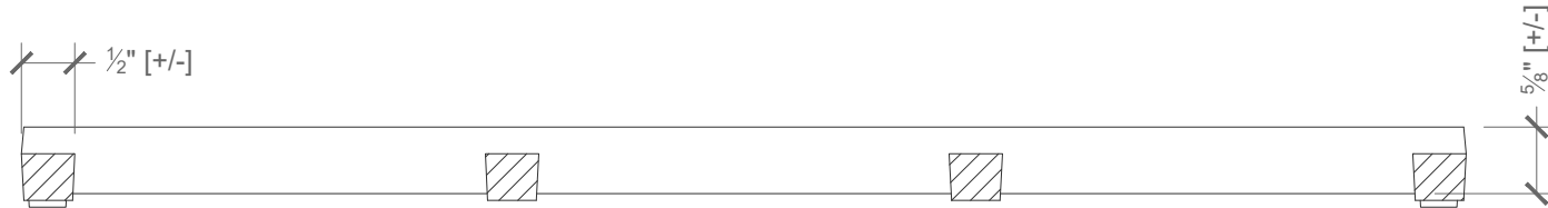
Cross Section Scale: 6" = 1' 0"