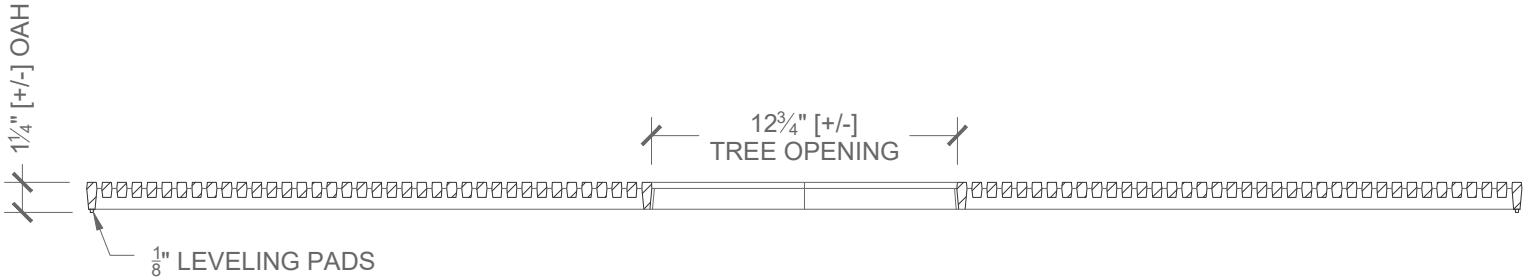
Cross Section Scale: 1 1/2" = 1' 0"