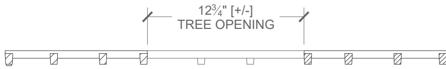
Longitudinal Section Scale: 1 1/2" = 1' 0"