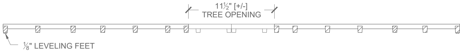
Longitudinal Section Scale: 1 1/2" = 1' 0"