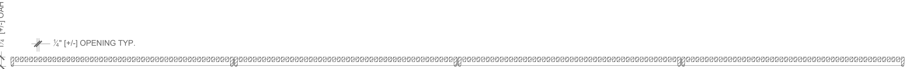
Cross Section Scale: 1 1/2" = 1' 0"