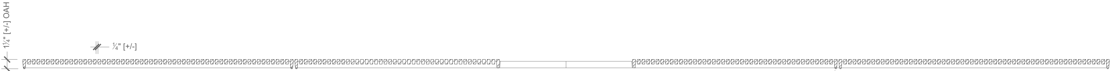
Cross Section Scale: 1 1/2" = 1' 0"