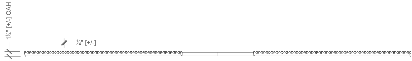
Cross Section Scale: 1" = 1' 0"