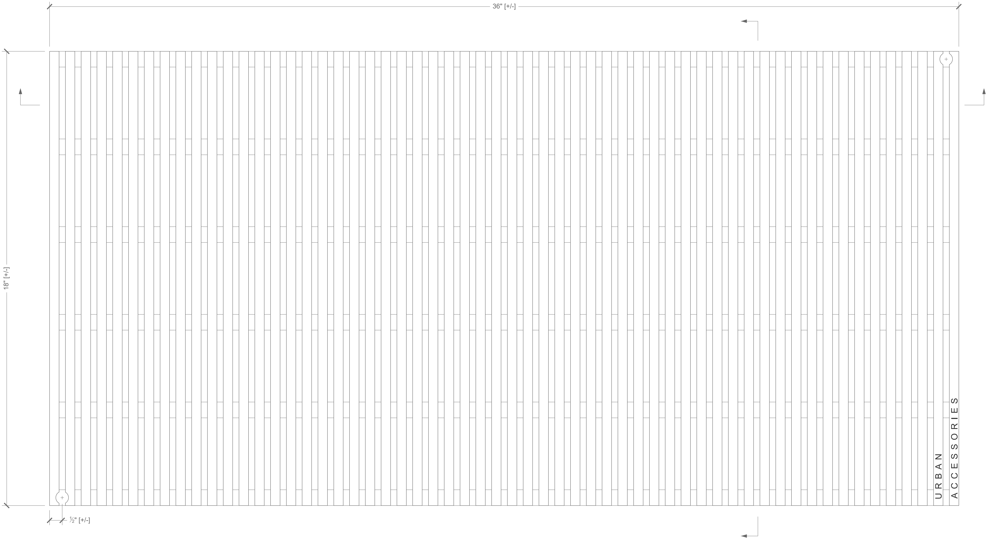
Plan Scale: 6" = 1' 0"