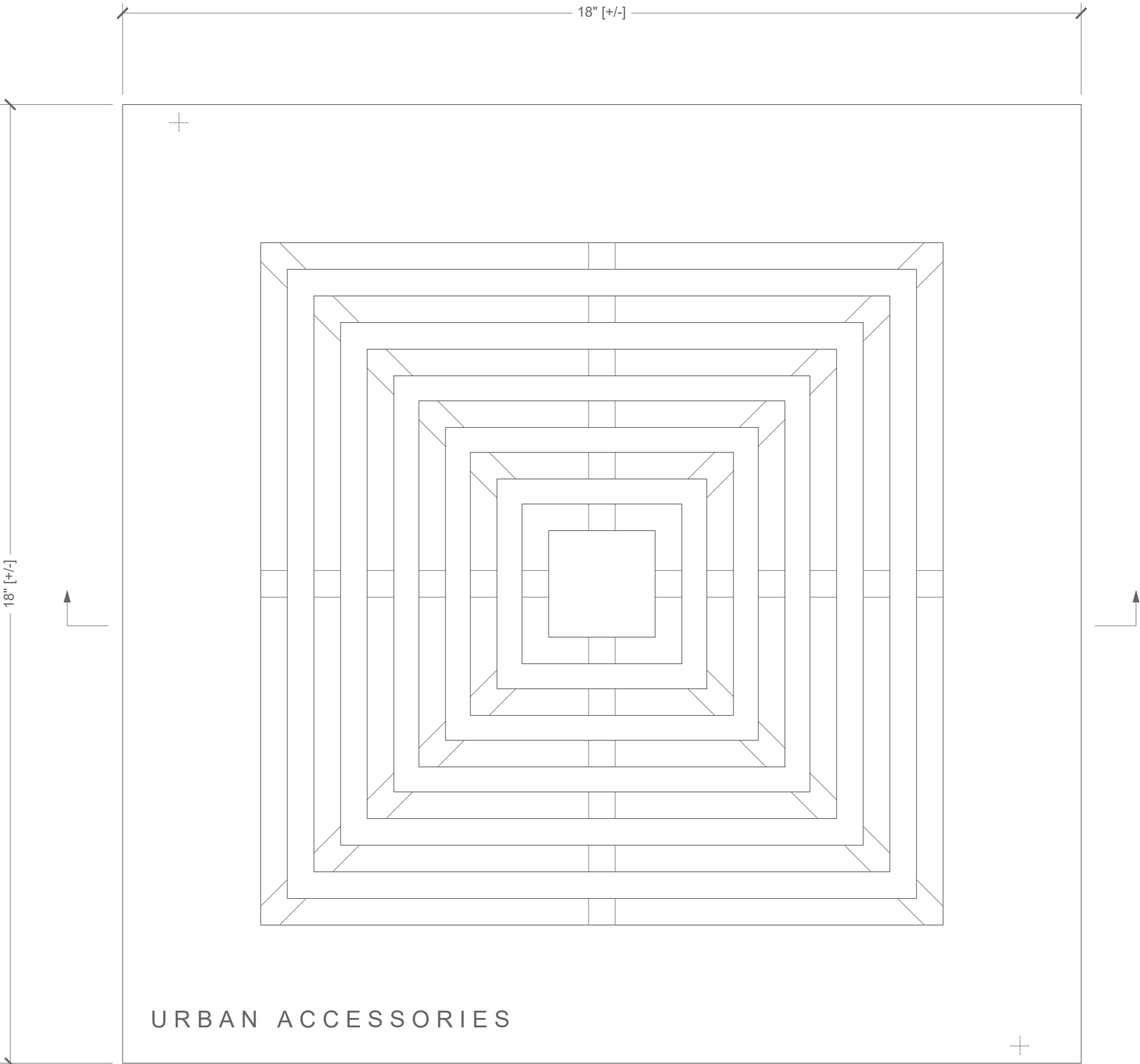
Plan Scale: 6" = 1' 0"