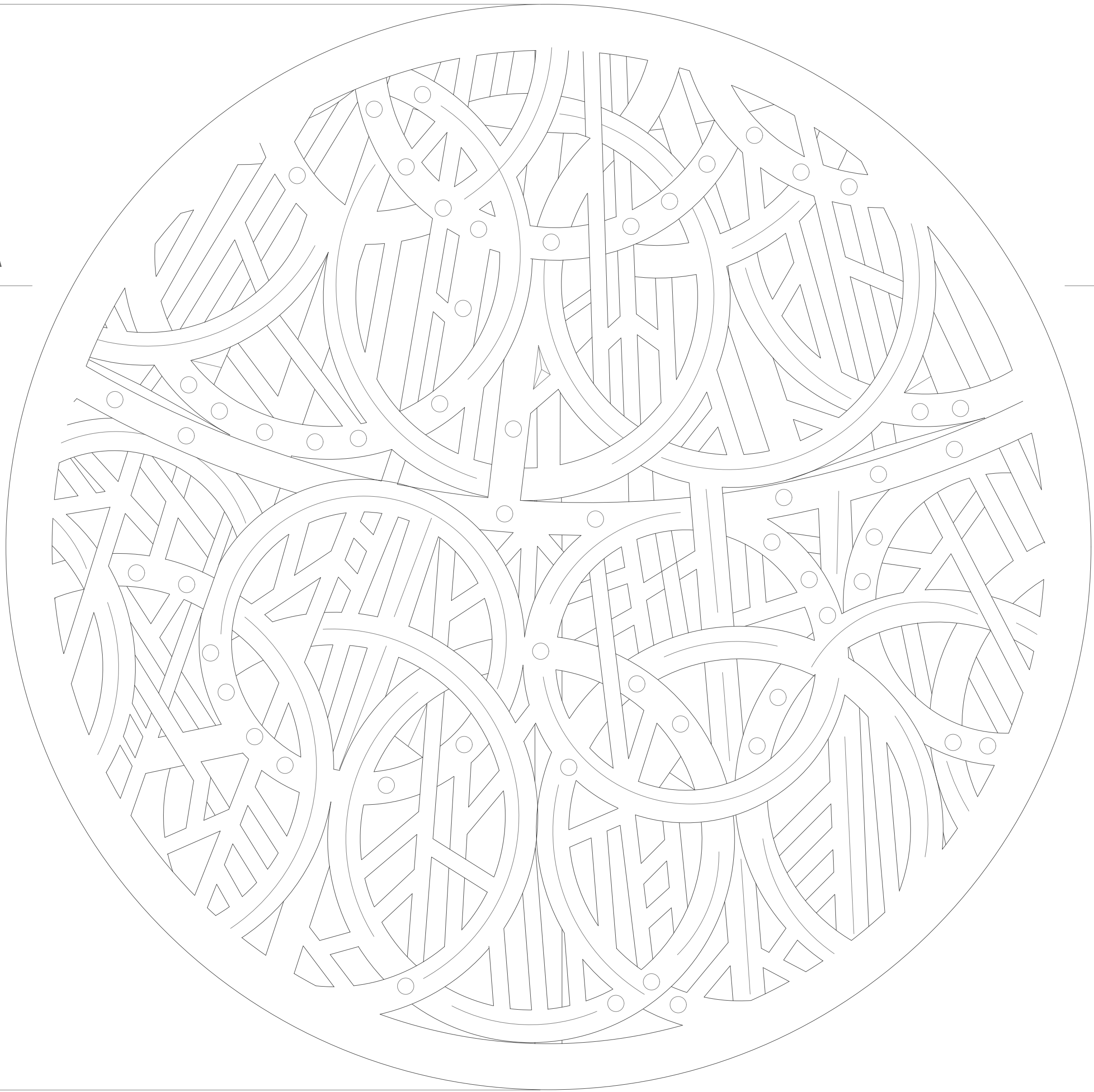
Plan Scale: 6" = 1' 0"