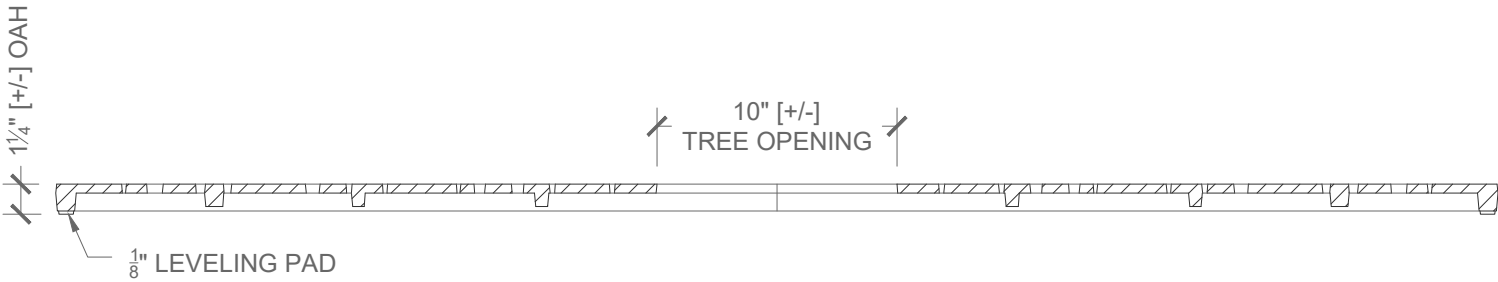
Cross Section Scale: 1 1/2" = 1' 0"