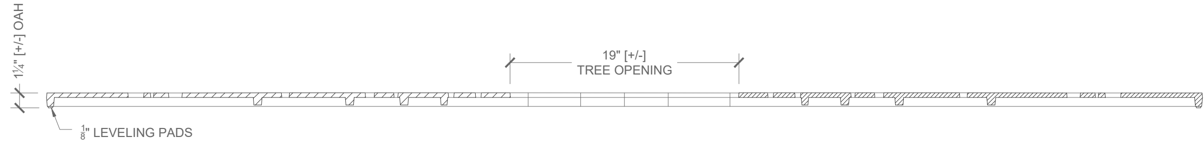
Cross Section Scale: 1 1/2" = 1' 0"