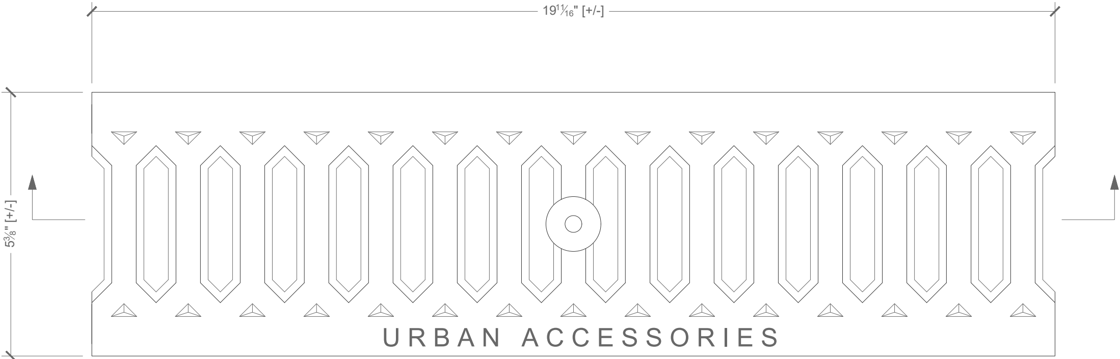
Plan Scale: 6" = 1' 0"