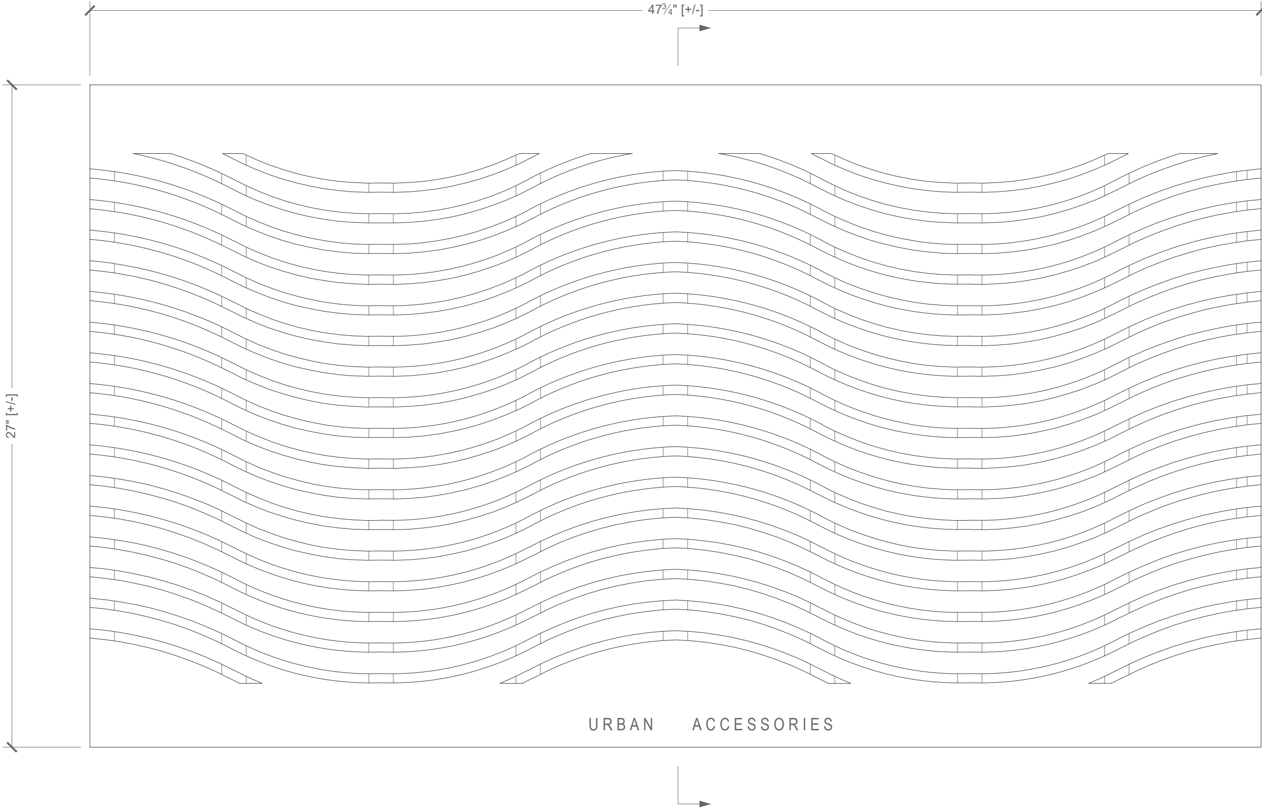
Plan Scale: 6" = 1' 0"